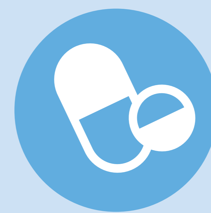
Applied Clinical Pharmacology