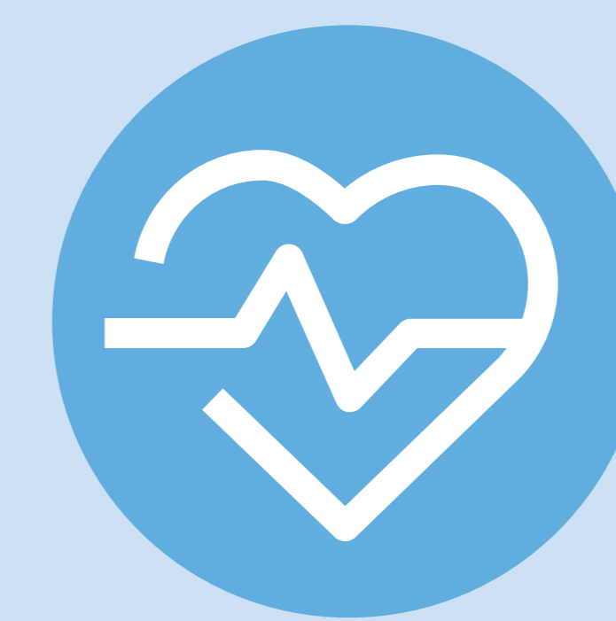
Human Physiology and Pathophysiology