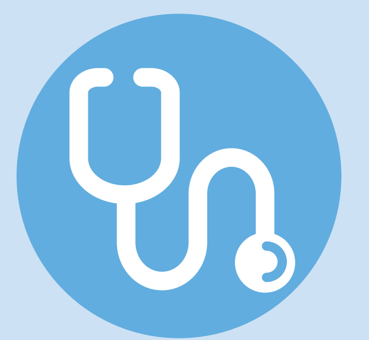
Anesthesia Equipment, Technology, and Safety